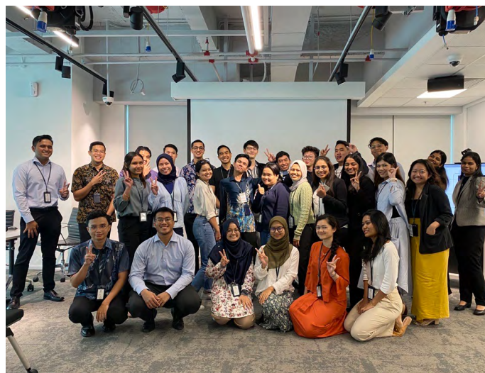
► KGTP 2022 cohort Induction Day

Top performing graduates are offered the chance to continue their careers as an Associate with Khazanah, giving them a unique opportunity to apply their talents towards driving the nation's continued advancement.