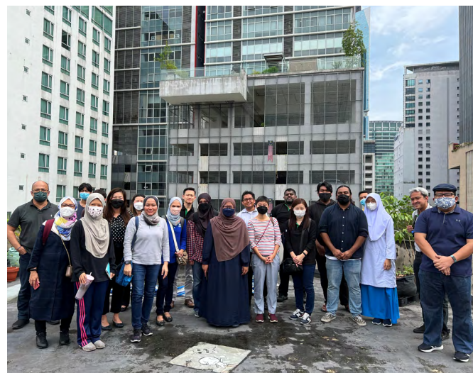
► Immersion visit and sharing by Sekolah Buku Jalanan Chow Kit, with a KLDP cohort

The programme is divided into two tracks: