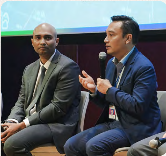
The Future of Cybersecurity in the Age of AI - Collaborated with NACSA and the Asia School of Business to highlight the importance of AI and the new Cybersecurity Bill 2024 to Board members of Khazanah-linked companies in June 2024.

The AI Cyber Security Session, held in collaboration with Asia School of Business and the CTO Circles, was another NexGen initiative to address evolving cybersecurity threats powered by emerging AI technology. Efforts under NexGen have led to Khazanah's digital maturity improving to 72% in 2024 from 53% in 2023.