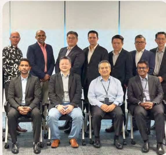
CTO Circle 2024 - Engaged with chief technology officers from Khazanah-linked companies and government-linked investment companies (GLICs) in October 2024 to collectively address talent development and challenges in light of emerging AI capabilities and new cyber threats.