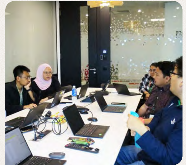
Giving Back to Society - Established cross-functional teams in Khazanah and Yayasan Hasanah in December 2024 to support non-governmental organisations such as Women of Will increase their digital knowledge and capabilities.